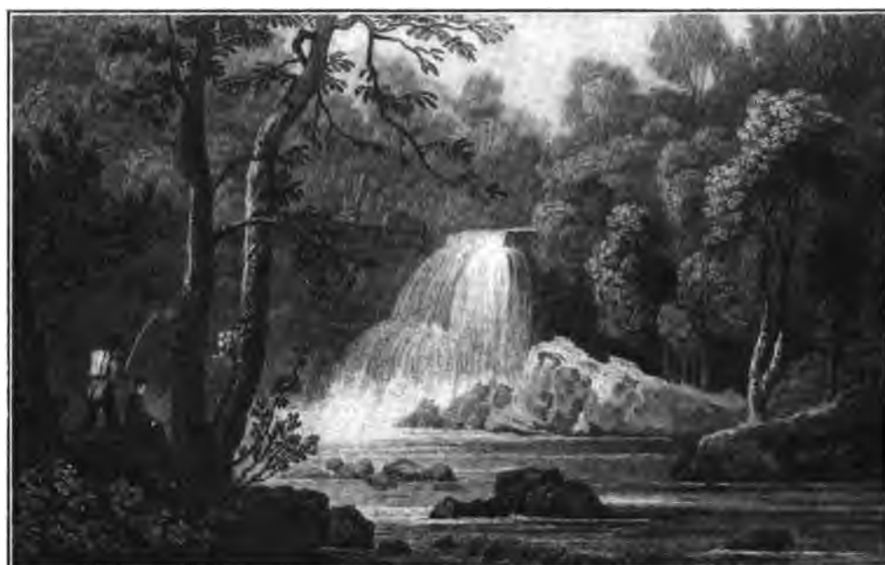
RHAIADYR DU CATARACT